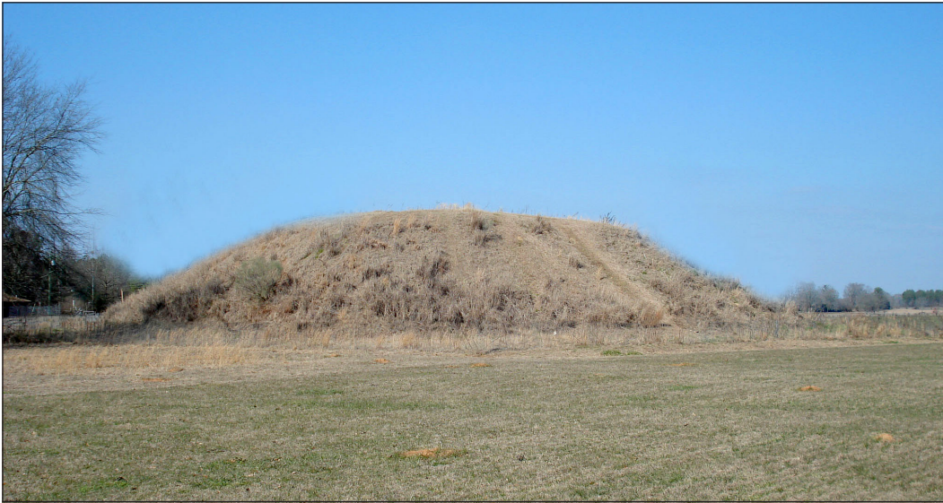
Nvnih Waiya Mound, located in Winston County, Miss., is the ending destination of the Choctaw migration stories and the Tribe's most sacred site.