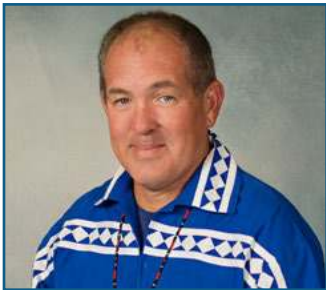
James Dry District #9