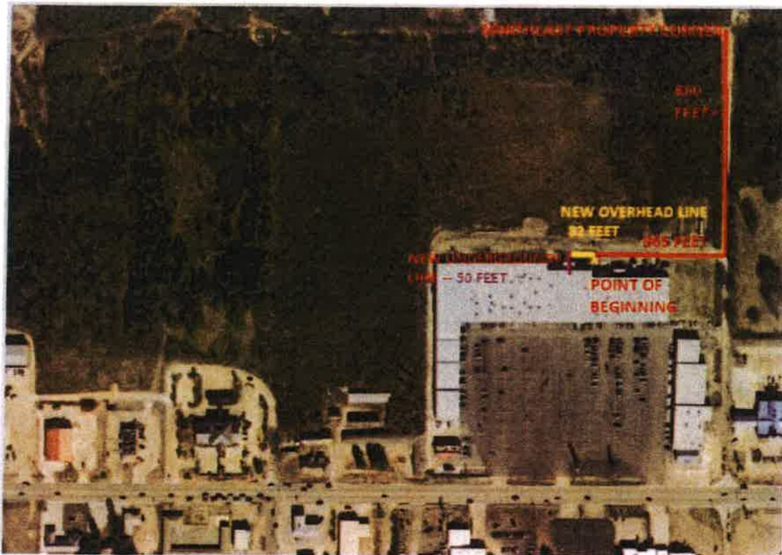
Exhibit "B" – Centerline description – Page 1 of 2

Owner USA in Trust for the CHOCTAW NATION OF OKLAHOMA